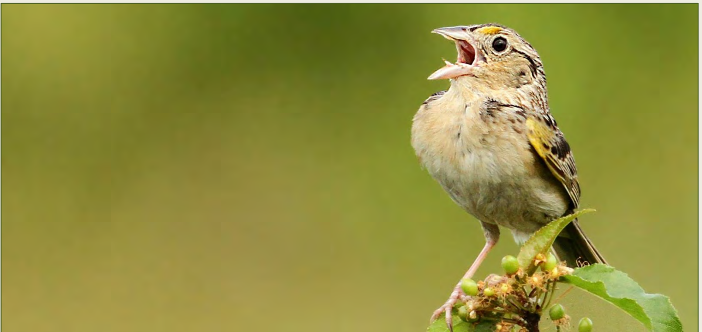
Grasshopper Sparrow