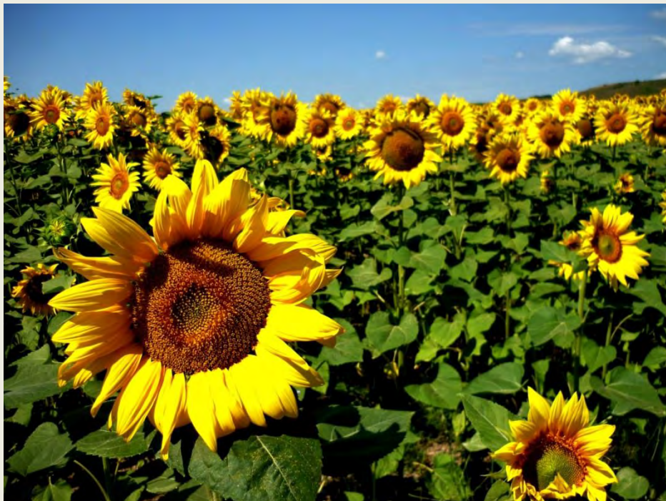
Sunflower field