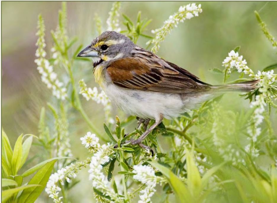
Dickcissel