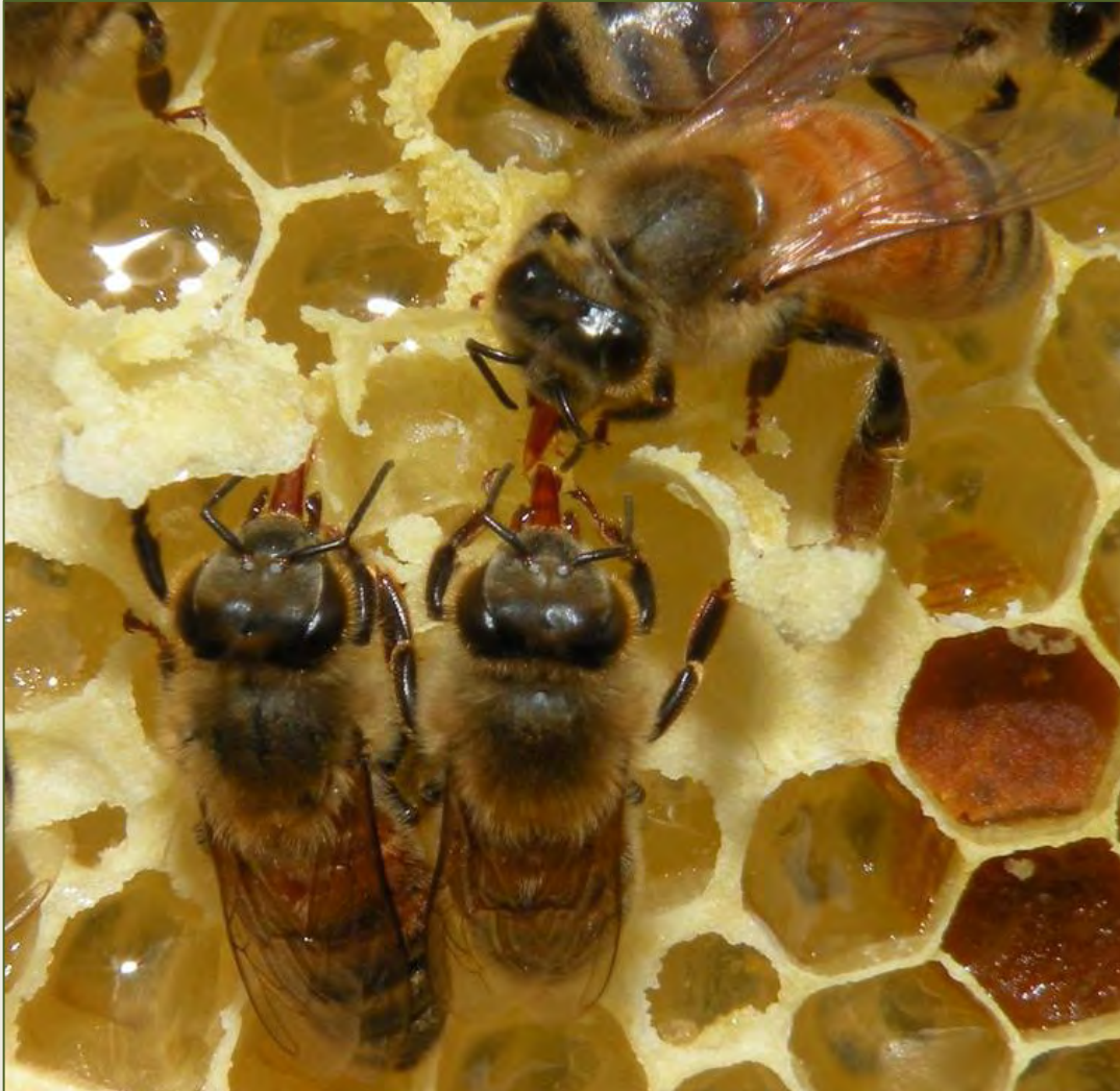
Honeybees

taken from streams in southern Ontario draining either urban or rural areas, the latter being either orchard-dominated or field-crop dominated. The data are summarised in Table 7.13. 23