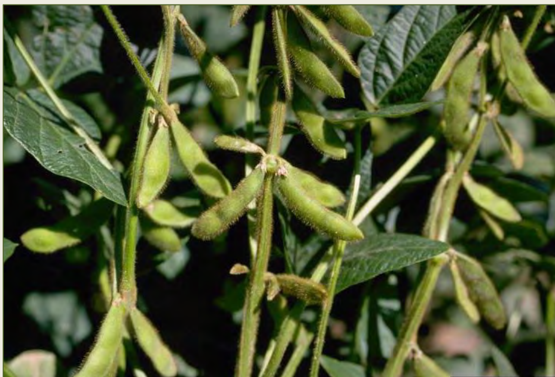
Soybean plants