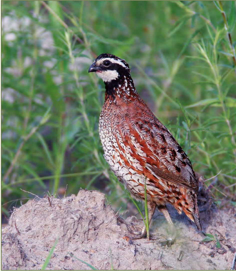
Northern Bobwhite