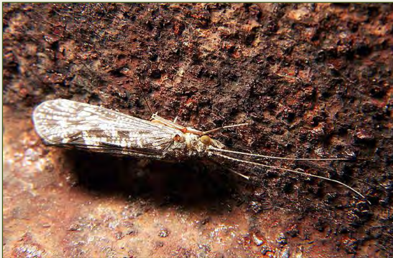
Caddisfly