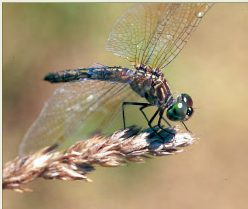
Dragonfly on wheat

A species sensitivity distribution based on the normally distributed acute data returns an HC5 of 1.01 ug/l for crustacea (0.06-6.8) and an almost identical 1.02 ug/l for aquatic insects (0.31-2.06). Despite the overlap, the insects appear to have a much lower sensitivity variance – i.e. more similarity in response. A pulse of imidacloprid in the ug/l range would therefore be expected to affect a larger proportion of the insect community.