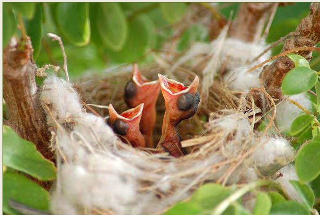
Altricial chicks