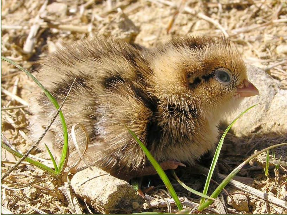
California Quail chick